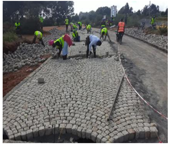
Figure 3: Construction of Cobblestone Pavement Trial Section on Road L8_Mavoko Mua-Kaseve in Machakos County