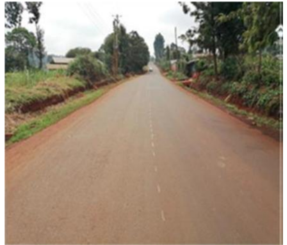
Figure 5: The completed Wangige – Nyathuna Road in Kiambu County