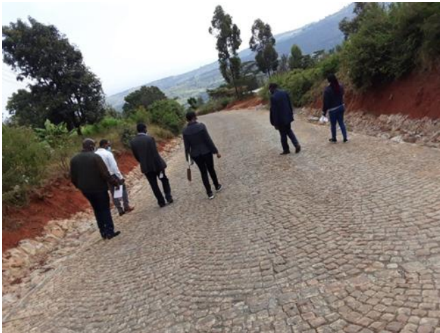
Figure 4: Final Inspection of Cobblestone Pavement Trial Section on Road L8_Mavoko Mua-Kaseve in Machakos County