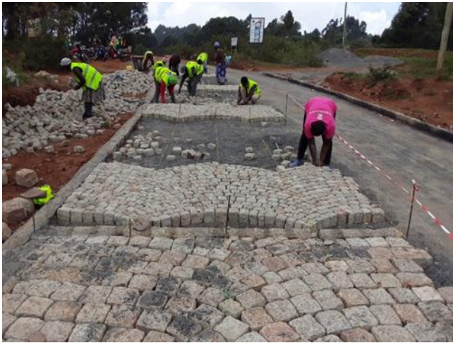
Figure 2: Construction of Cobblestone Pavement Trial Section on Road L8_Mavoko Mua-Kaseve in Machakos County