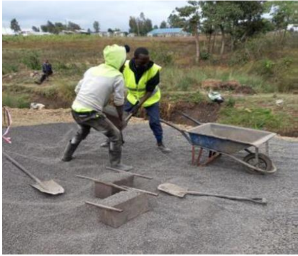
Figure 6:Batching aggregates for Cold mix Asphalt Concrete on the Muiyogo - Endarasha Road in Nyeri County