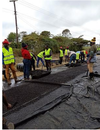
Figure 7: Laying Cold mix Asphalt Concrete